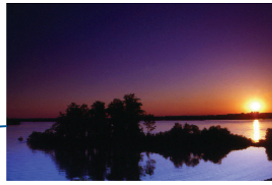
West Branch, Portage County