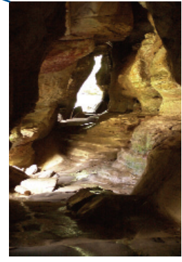
Hocking Hills Rock House, Hocking County