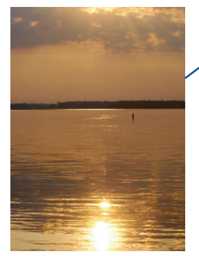
Indian Lake, Logan County