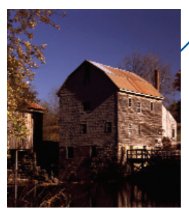
Barrett's Mill, Highland County