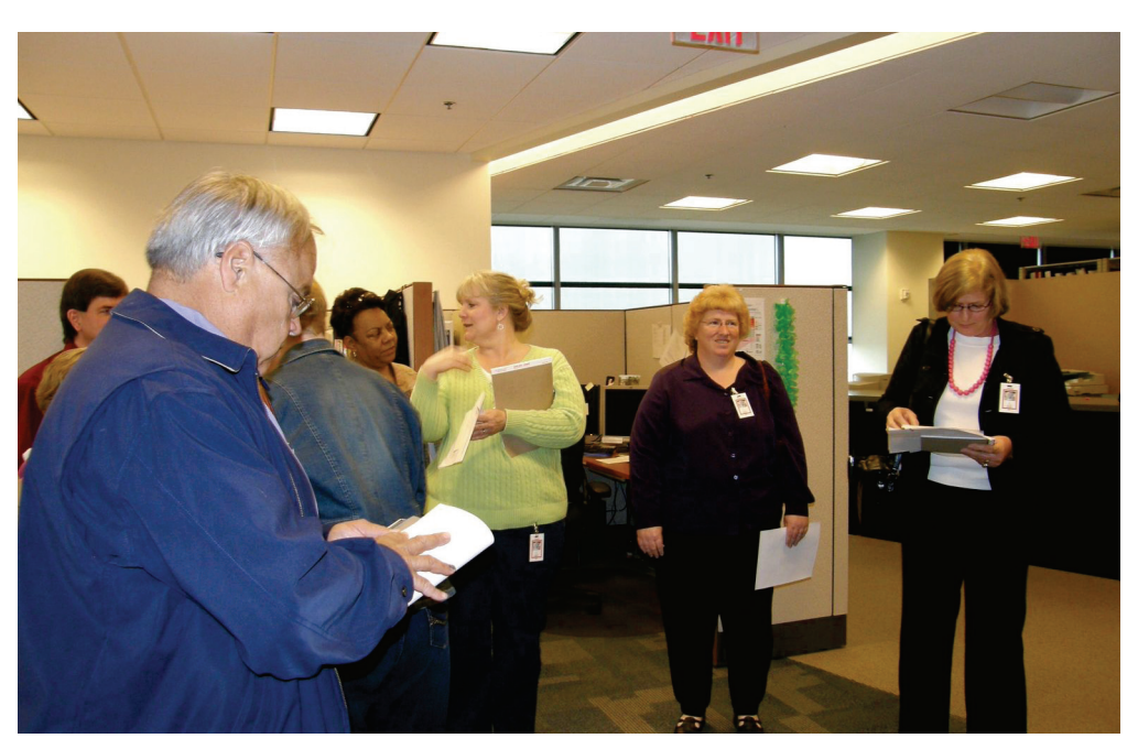
Time permitting, attendees can tour Employer Outreach—meet the people you've been talking to and learn, first-hand, what exactly goes on here.