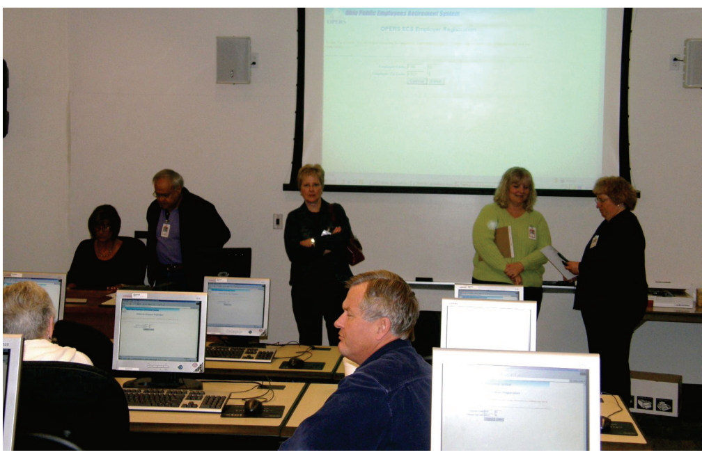
The ECS seminars and demonstrations provide hands-on training and have plenty of time for instructor-attendee interaction.