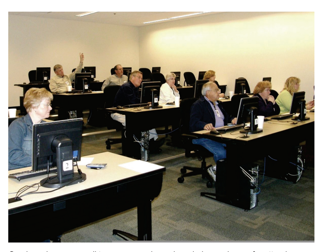
Seminar sizes are small to ensure maximum knowledge exchange for attendees.

Ever wonder if the employer-specific seminars sponsored by Employer Outreach are worth your investment of time? We recognize that choosing to attend a seminar represents a significant amount of time away from the office, but we think that investment in time and effort pays off with significant dividends down the line—for a variety of reasons: