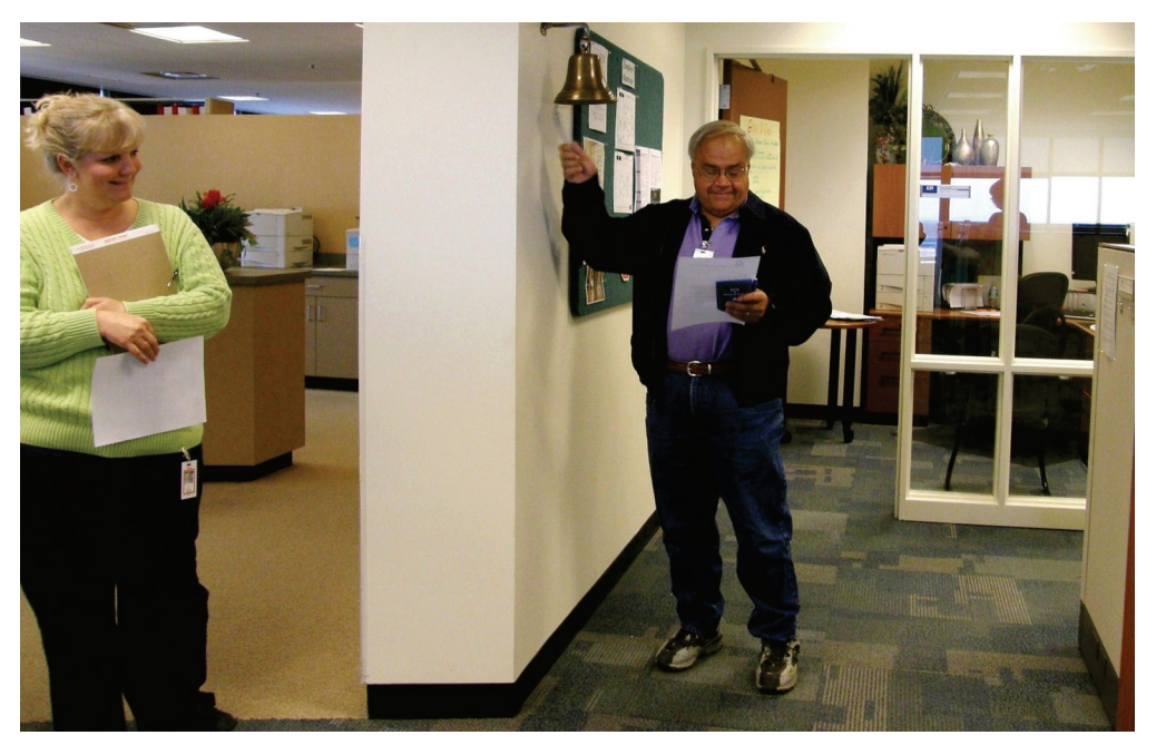
Signing up...after the ECS seminars and demonstrations, some employers are ready to sign up for online reporting. Those who do get to ring the bell—sounding off to all of Employer Reporting that another employer has signed up for reporting via ECS.