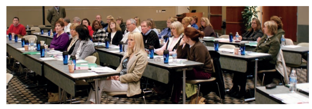
More than 30 employer representatives attended Employer Reporting's college and university-specific training in November.

And, you'll see in 2009 that we'll be test marketing new ways to deliver our materials; the schedule will note when topics will be delivered via Web-based seminars.