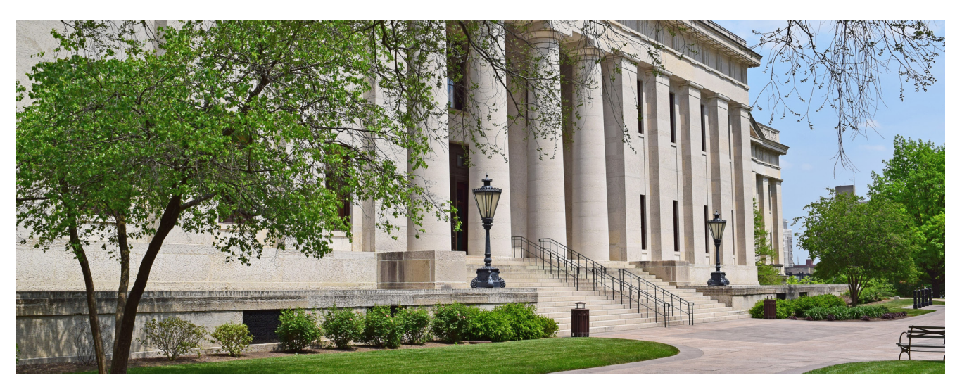
OPERS age and service retirees who return to OPERS-covered employment as elected officials are treated as re-employed retirees.

An elected official should contact OPERS and their public employer to determine whether retirement and re-employment will impact pension benefits. The OPERS health care program is not available during a period of pension suspension.